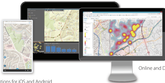
Mobile Applications for iOS and Android

As citizens become familiar with the power of geographically driven websites for information gathering as weather, traffic, nearby shopping deals, and more, they increasingly expect cities to use this smart technology to increase efficiencies and decrease cost. InterDev has years of experience working with local governments to achieve this goal. We are committed to increasing efficiencies and decreasing cost using GIS technology. InterDev's GIS team instills these values in all the applications we deploy.